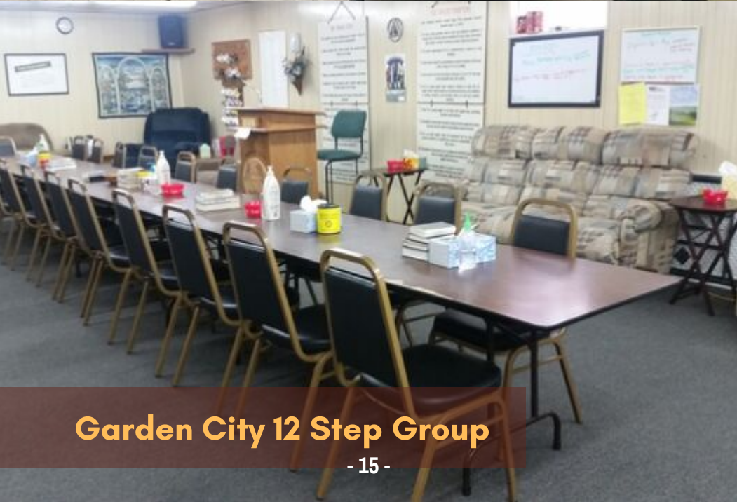
Garden City 12 Step Group