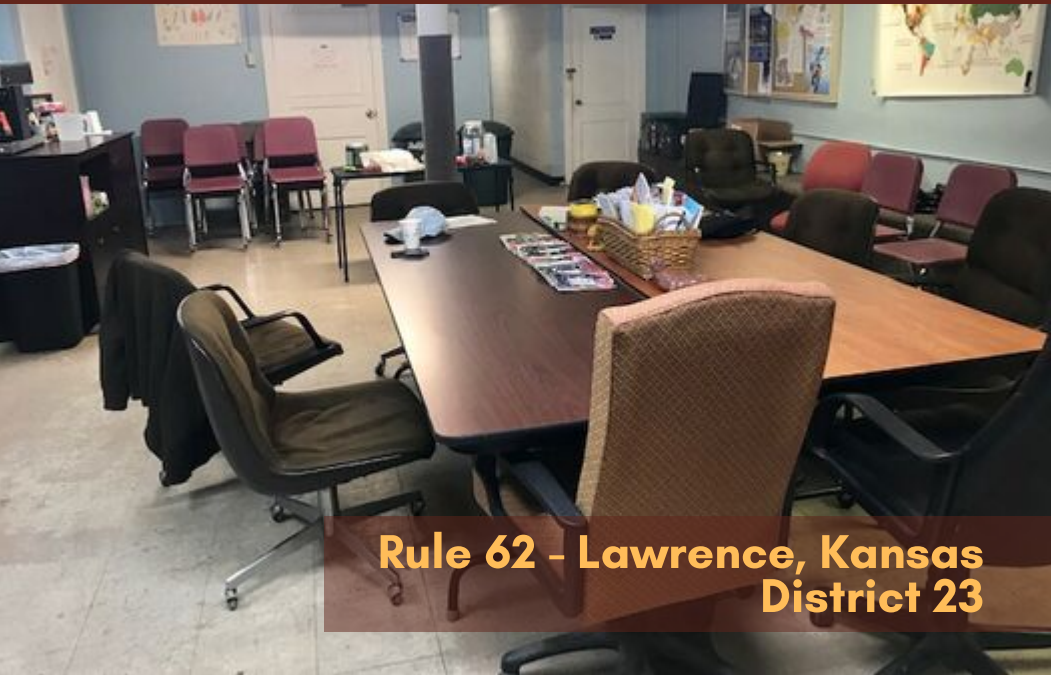
Rule 62 - Lawrence, Kansas District 23