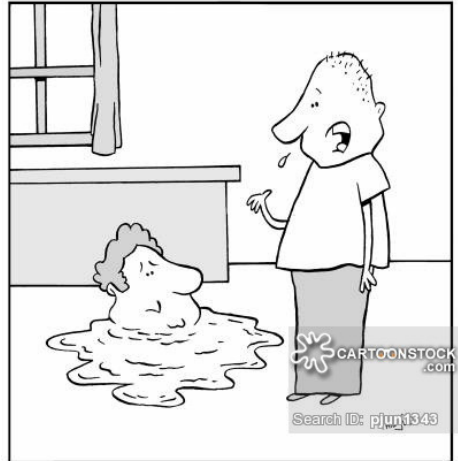
"How is the detox going?"